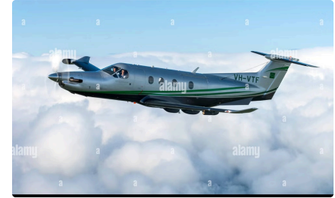
Pilatus PC12/45 & PC12/47