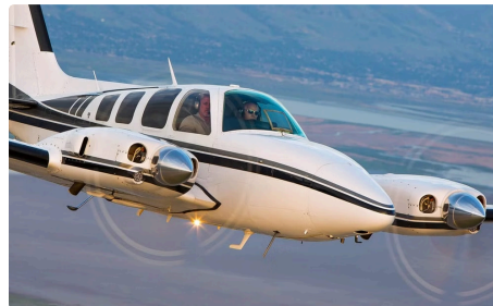
Beech Baron 55/ 58