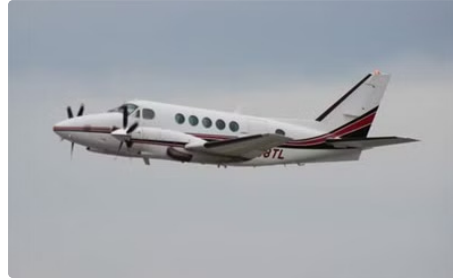
King Air B100