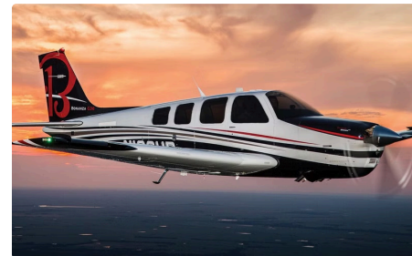
Beech Singles BE23/24/33/35/36