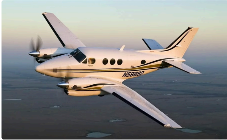
King Air C-90 Series