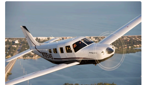
PA32 & P32R