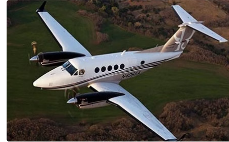
King Air 200/B200