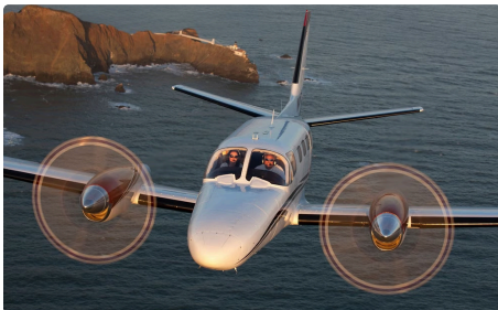
Cessna 400 Series